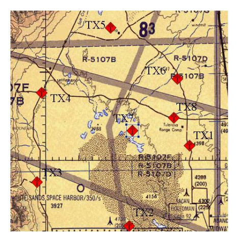
Figure 8 Sample Jammer Laydown

at low, medium, high, and ramped power levels. The specific waveforms broadcast included Bi-Phase Shift Key, Broadband, Partial Band, Continuous Wave and Swept Continuous Wave, and Pulsed Continuous Wave on both L1 and L2 frequencies.