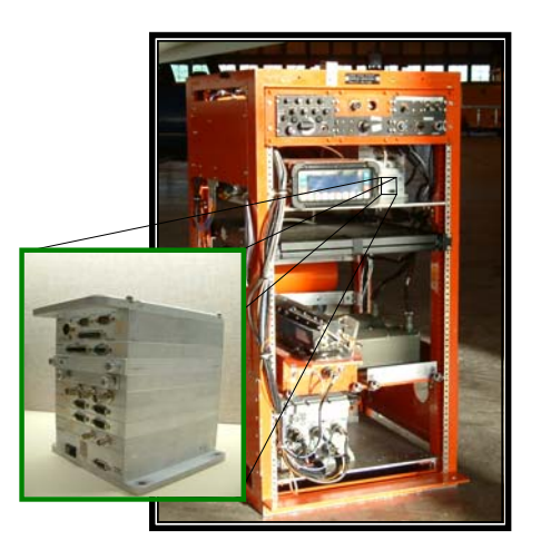
Figure 5 CIGTF Reference System

In any test environment where navigation aids are evaluated, it is paramount that the truth reference data is preserved and collected. This is particularly difficult to achieve in a live GPS jamming environment, because many reference systems use GPS to obtain an accurate truth source. To overcome this obstacle, the 746 TS developed the CIGTF Reference System (CRS); this was the reference system used for JAMFEST. The CRS is a rack-mounted (see Figure 5), loosely/tightly-integrated system, consisting of navigation sensors/subsystems, Data Acquisition System (DAS), and post-mission processing mechanization (see Figure 6). Figure 5 CIGTF Reference System