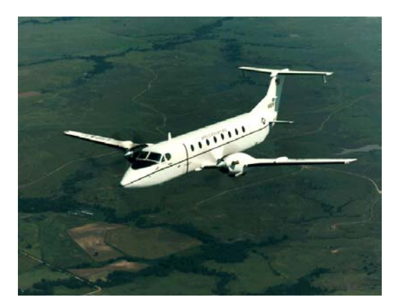
Figure 4 C-12 J Aircraft

During JAMFEST, the C-12J carried 746 TS equipment designed to collect airborne reference measurements of the GPS jamming environment. It flew data collection sorties that spanned the airspace and altitudes used by the systems under test.