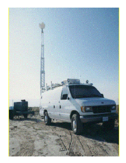
Figure 1 Portable Field Jamming System (PFJS)

One of the primary test resources used to create the jamming environment was the Portable Field Jamming System (PFJS). The PFJS (see Figure 1) is a modified Ford 350 van with a full suite of GPS Electronic Warfare (EW) equipment, which included TMC Advanced Threat Emulators (TATEs) and TAVIA-32 Emulators (TAVIAs) as well as a variety of high power adjustable amplifiers. The onboard EW equipment was programmed to provide a wide range of jamming scenarios and signal modulations. The system records time-tagged amplifier power output for test analysis and time correlation to the test item.