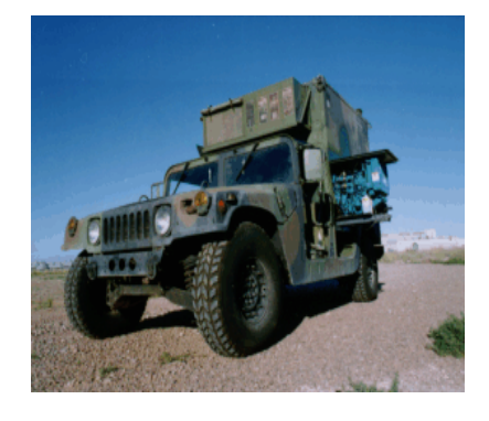
Figure 2 Tactical Field Jamming System

Portable Box Jammers (PBJ) (see Figure 3) in conjunction with the PFJSs and TFJSs, were set up along designated range roads and remote locations to help create the jamming environment. Each PBJ is a standalone jamming system designed to supply the same capabilities as the PFJS and TFJS, but in a smaller, more versatile package. Each system was equipped with portable generators, a portable antenna mast and tower, and a full suite of GPS EW equipment that included TATEs and TAVIAs, as well as a variety of high power adjustable amplifiers.