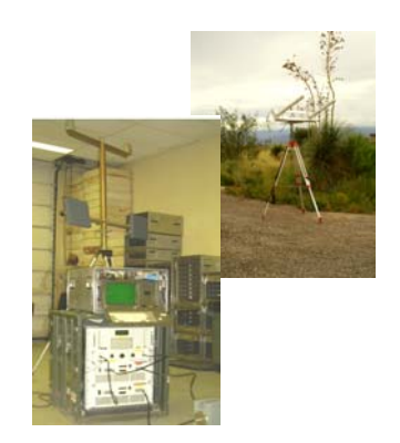
Figure 3 Portable Box Jammer

Portable Box Jammers (PBJ) (see Figure 3) in conjunction with the PFJSs and TFJSs, were set up along designated range roads and remote locations to help create the jamming environment. Each PBJ is a standalone jamming system designed to supply the same capabilities as the PFJS and TFJS, but in a smaller, more versatile package. Each system was equipped with portable generators, a portable antenna mast and tower, and a full suite of GPS EW equipment that included TATEs and TAVIAs, as well as a variety of high power adjustable amplifiers.